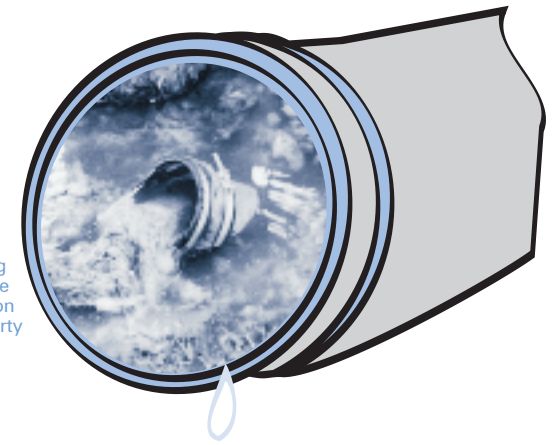
Overflowing cleanout pipe located on private property

Always notify your city sewer/public works department or public sewer district of sewage spills. If the spill enters the storm drains also notify the Health Care Agency. In addition, if it exceeds 1,000 gallons notify the Office of Emergency Services. Refer to the numbers listed in this brochure.